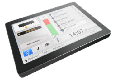
Consat Driver Display (CDD)