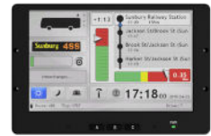
Consat Driver Terminal (CDT)